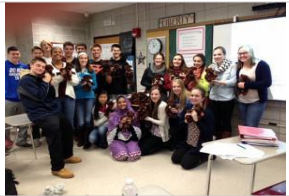
Members of the Foxboro High School AP U.S. History class show some the Teddy bears they purchased to be given by police and firefighters to children in distress.

Story published in the Foxboro Reporter – December 4, 2014